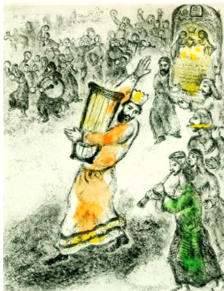
King David | Marc Chagall

Psalm 27:6 : “For in the day of trouble he will keep me safe in his dwelling; he will hide me in the shelter of his sacred tent and set me high upon a rock. Then my head will be exalted above the enemies who surround me; at his sacred tent I will sacrifice with shouts of joy; I will sing and make music to the Lord.”